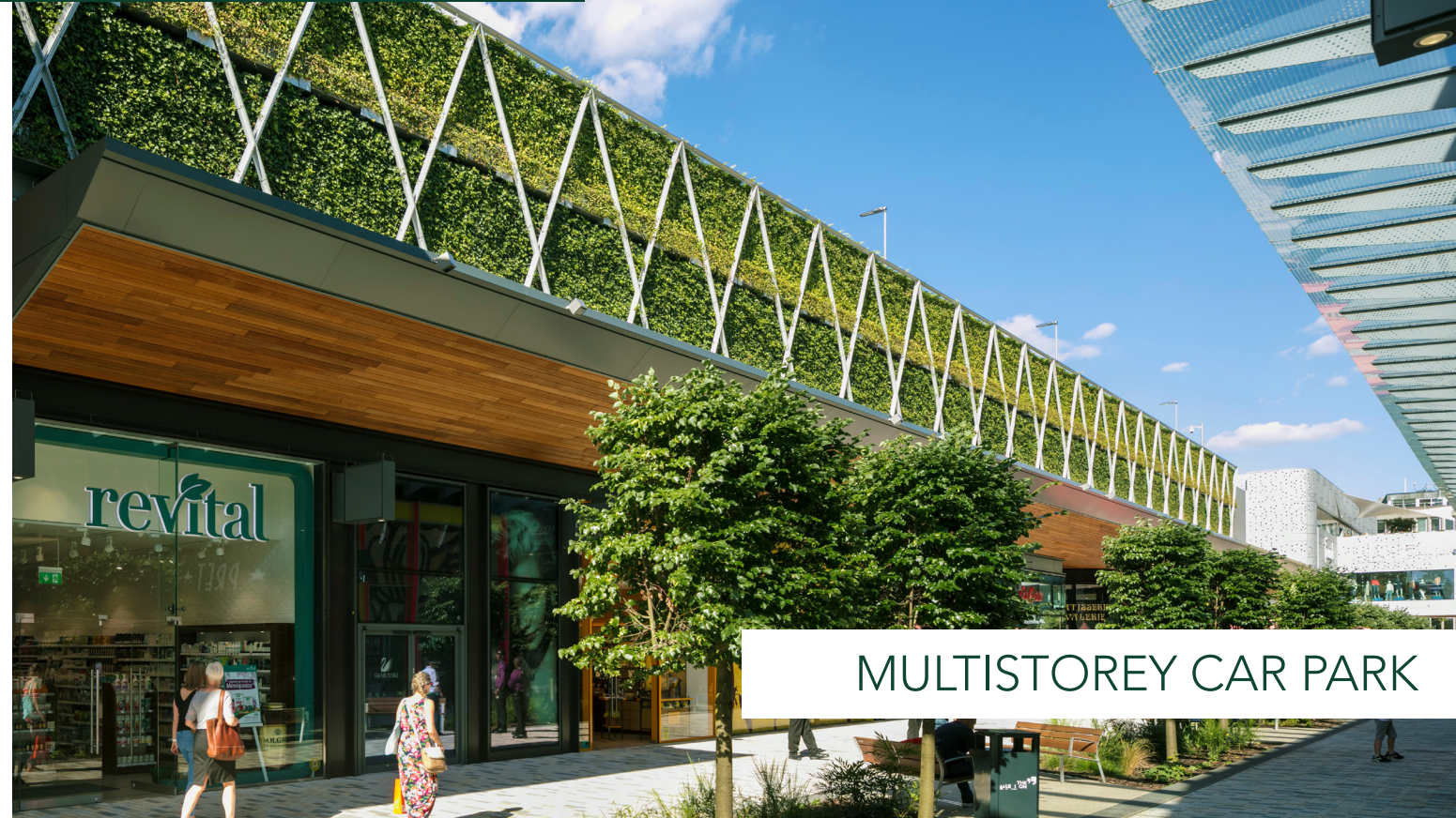
MULTISTOREY CAR PARK