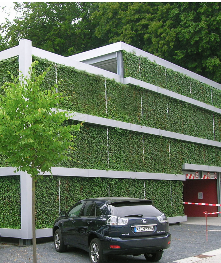
MULTISTOREY CAR PARK